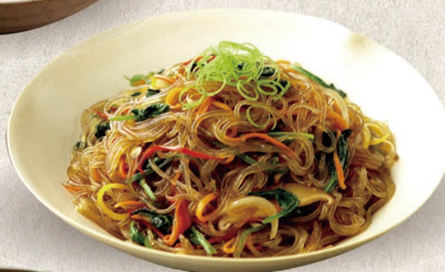
JabChe 잡채 $23 * Vegetable