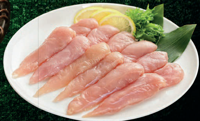
Chicken BBQ 치킨 바베큐 Marinated chicken bbq $24 180g