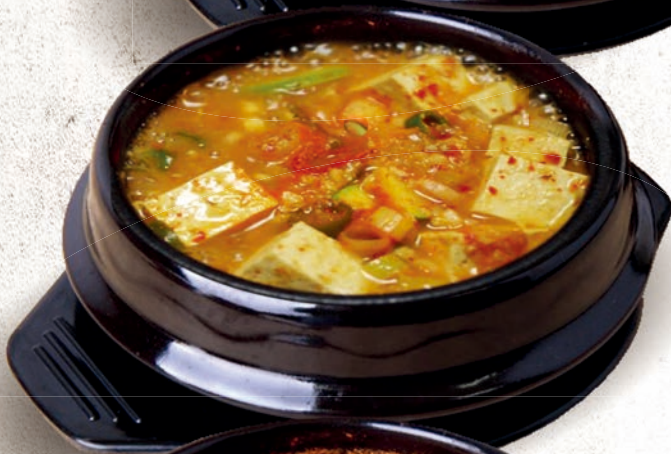
DoinJangJjigae 된장찌개 $16

Traditional Korean Bean Paste Stew With Bean Curds And Vegetable, Zucchini