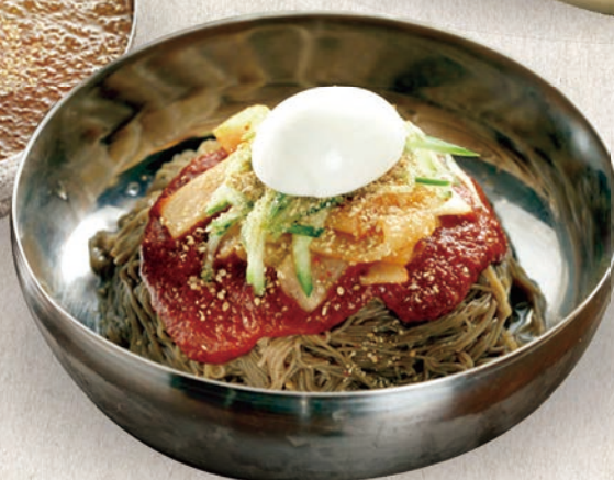
BiBimNaengMyun 비빔냉면 $18 Spicy Chilled Buckwheat Noodle *broth made of beef and pork