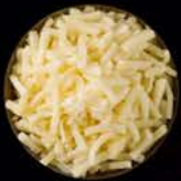
+ 모짜렐라 치즈 토핑 $4 + mozzarella cheese