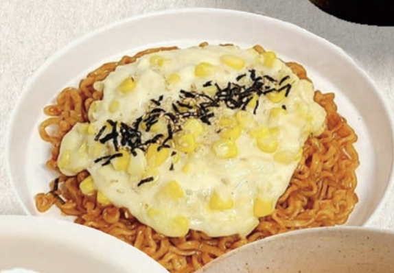
Buldak stir-fried noodles 불닭볶음면 $12 Hot Chicken Flavor Ramen + Add corn cheese 🌽🧀 $4