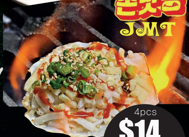
O.BBa Grilled Cheese Scallop 치즈 가리비 구이