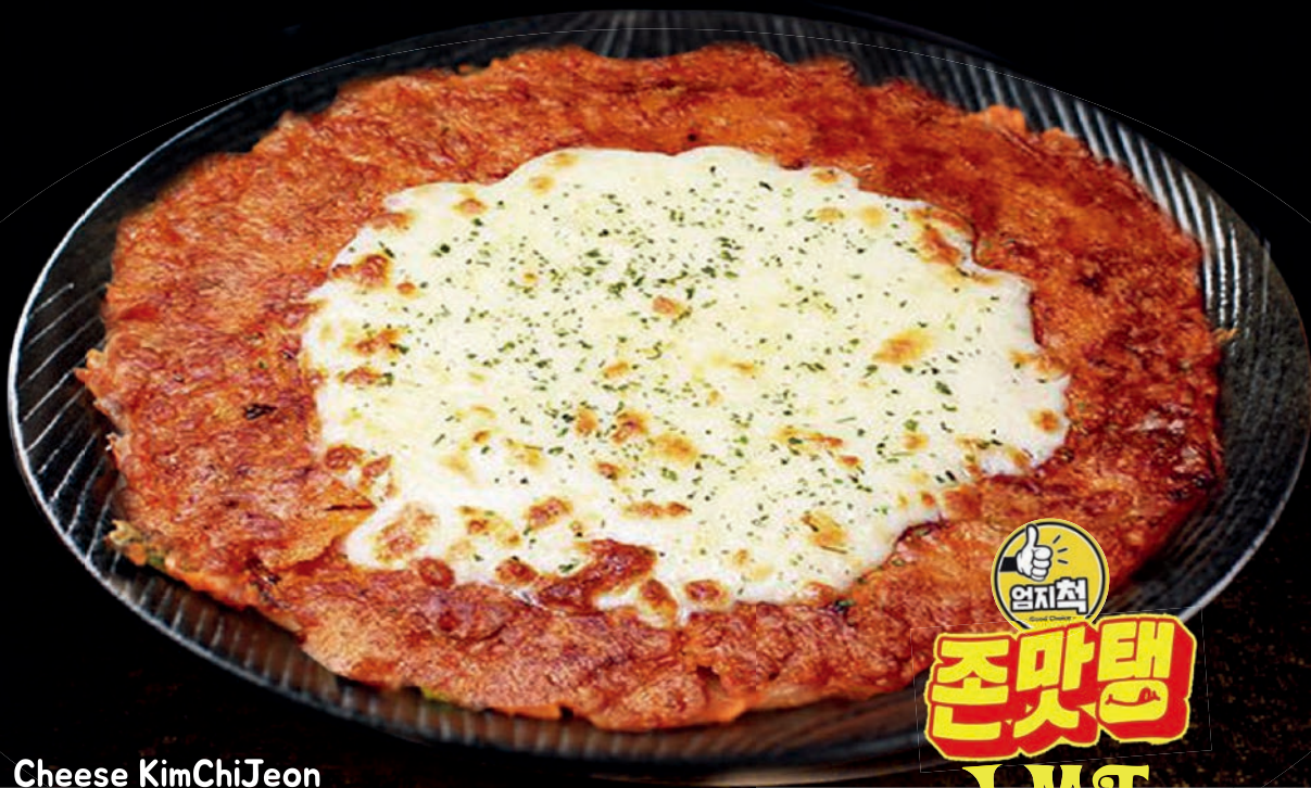
Cheese KimChiJeon 치즈김치전 $29 Kimchi pancake with cheese * 오징어 * Squid