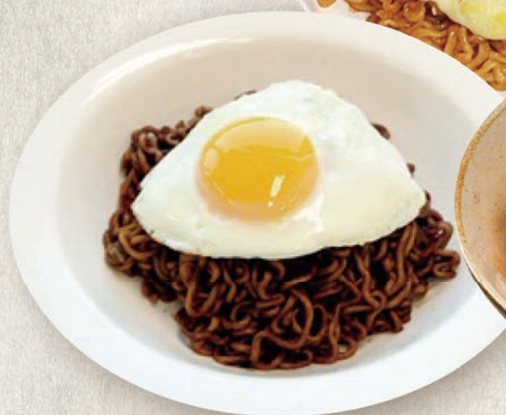
JjaPaGeTi 짜파게티 $11 Black Ramen