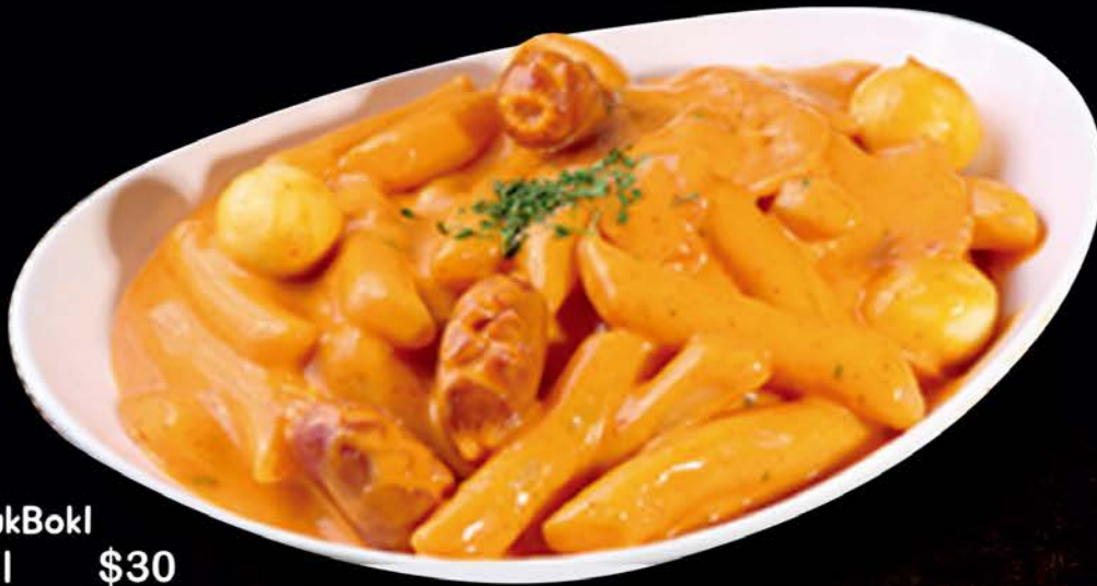
Rose DDukBokl 로제떡볶이 $30 Rosé sauce Ricecake