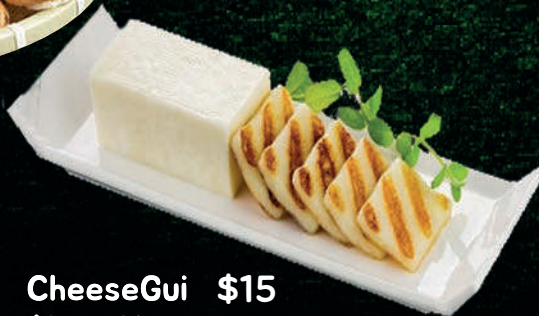
CheeseGui $15 치즈구이 Cheese BBQ