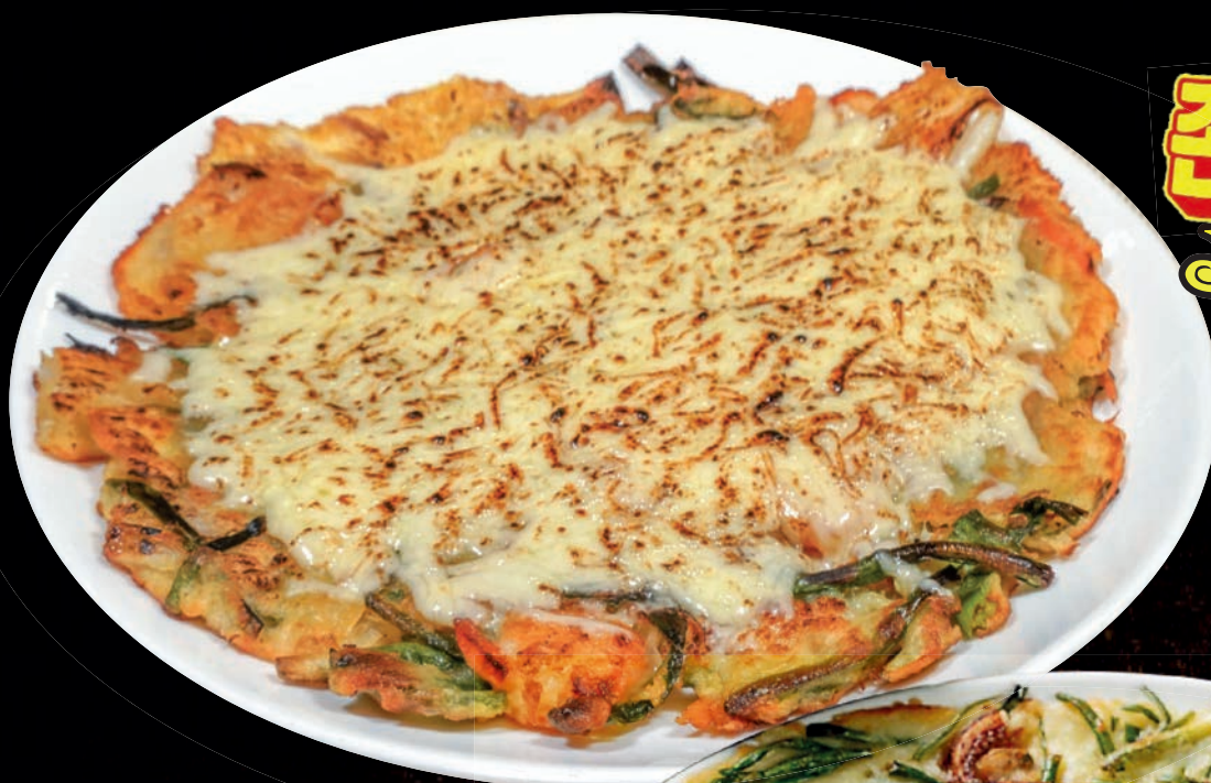
Cheese HaeMulPaJeon 치즈해물파전 $32 Seafood spring onion pancake with cheese