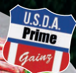
SaengGalBi $52.5 생갈비 05 Non Marinated Prime Beef Short Rib