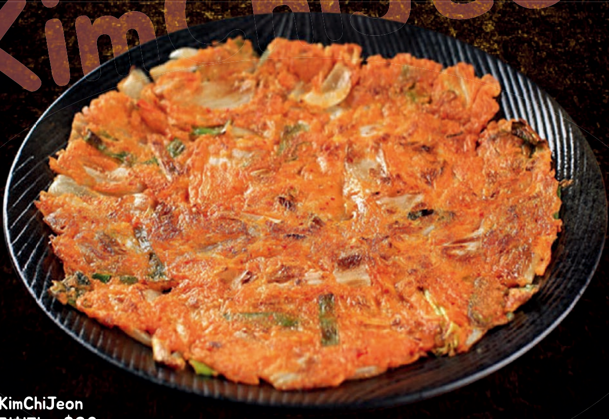
KimChiJeon 김치전 $26 Kimchi Pancake

Prices are subject to service charge and government taxCustomization subject to charges