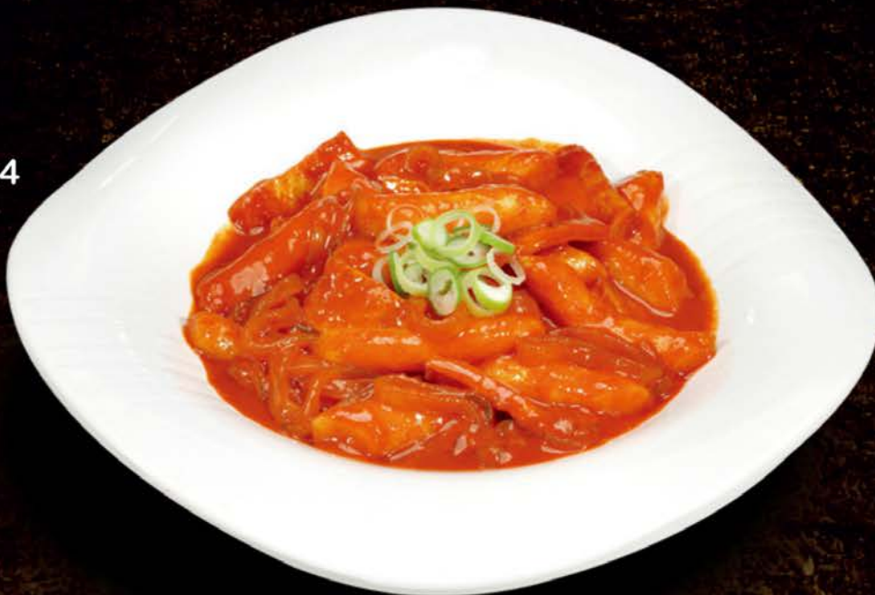
DDukBokl 떡볶이 $23 Spicy rice cake