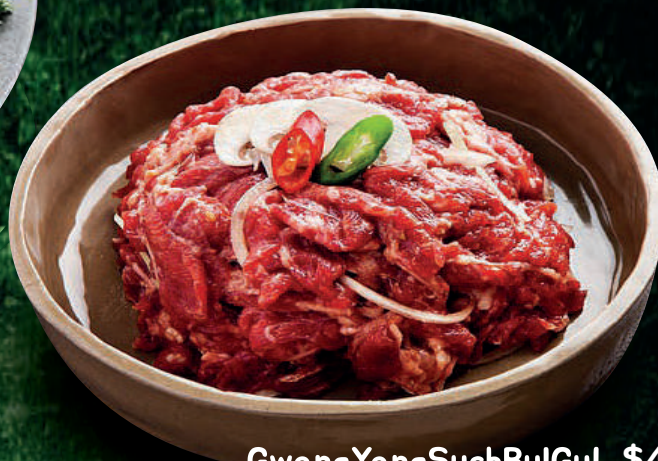
GwangYangSuchBulGul $43.5 광양숙불구이 08 180g Traditional Marinated Beef