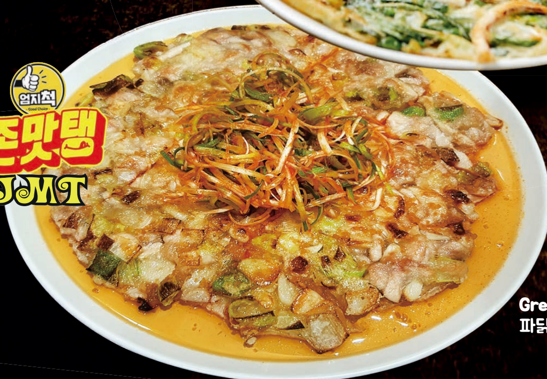
Green onion chicken pancake 파닭전 $28

Prices are subject to service charge and government tax Customization subject to charges