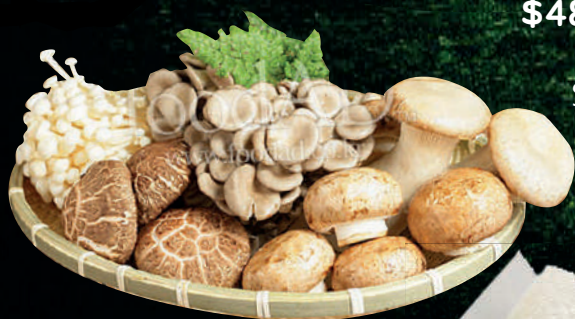
BuSusGul $17 버섯구이 11 Mushroom BBQ