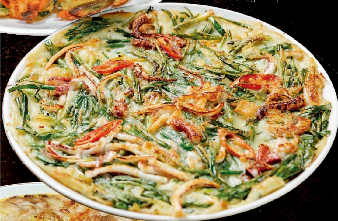
HaeMulPaJeon 해물파전 $29 Seafood Spring Onion Pancake