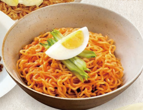
BiBimMyun 팔도비빔면 $12 Spicy sauce Ramen