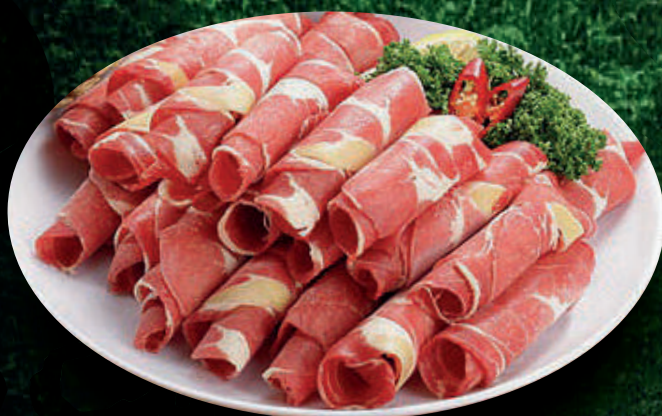
USamGeup $27.5 우삼겹 10 2mm of Sliced Beef Belly