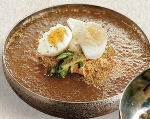
MulNaengMyun 물냉면 $18 Cold buckwheat noodles *broth made of beef