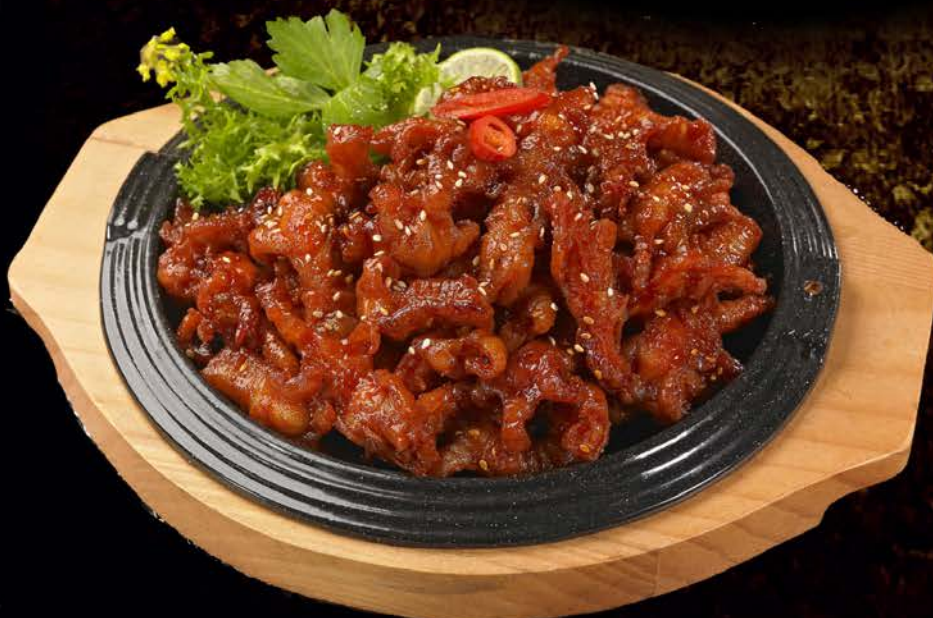
무배닭발볶음 $47 Stir-fried radish chicken feet