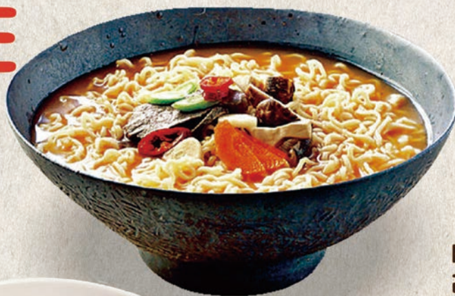
Ramen 라면 $11 + Add cheese 🧀 $2